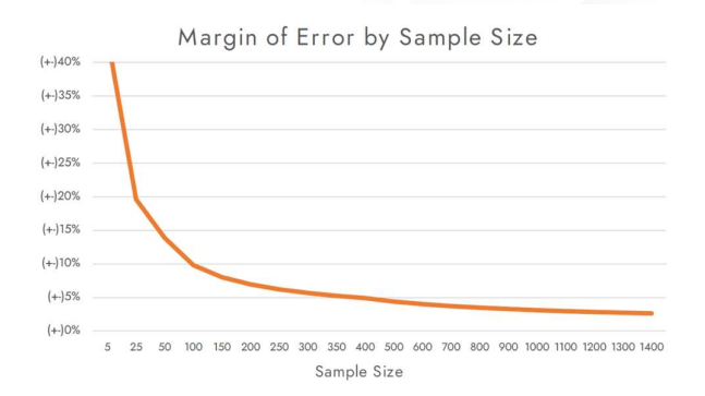
Table 3.4.2 Margin of Error, (Howell, 2020)

Larger samples are required when data is not normally distributed or is otherwise faulty in some way (usually the case). When data is skewed, kurtotic, incomplete, or otherwise less than perfect, it is difficult to give complete recommendations on sample sizes. The usual advice is to collect additional data wherever possible. However, the current research investigation is limited to just over 400 samples. Many commercial research companies suggest a sample size of 400 is often considered the baseline for survey research, as it allows for high precision (+-5% error) at a cost-effective sample size as shown in the chart below. (Howell, 2020.)