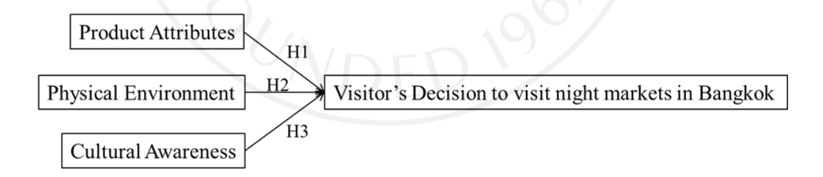
Figure 2.1: Attractive Factor for Consumers' Decision on Visiting a Night Market

This study sums them up as 'product attributes', 'physical environment', and 'cultural awareness' Therefore, the framework of this study could be presented as in Figure 2.1.